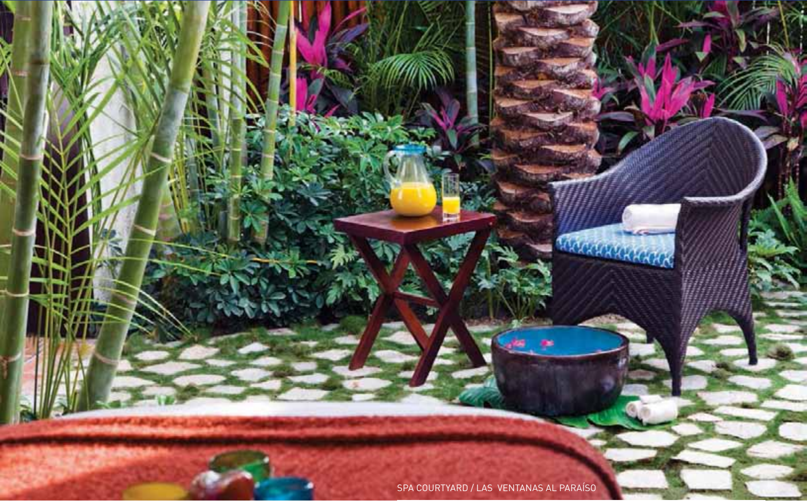
SPA COURTYARD / LAS VENTANAS AL PARAÍSO