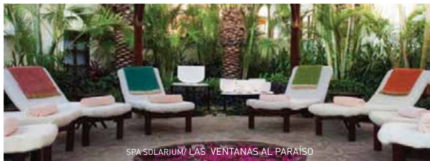
SPA SOLARIUM / LAS VENTANAS AL PARAÍSO

The Spa at Rosewood's Las Ventanas al Paraíso—the romantic getaway of choice for celeb couples like Jay Z and Beyoncé —gives guests a lesson in local holistic therapies with their Four Elements menu, inspired by the ancient healers of Baja. Treatments tap into the powers of earth, air, fire and water for ultimate restoration and rejuvenation. A major renovation in 2011 took the already award-winning spa to new heights. ( www.lasventanas.com )