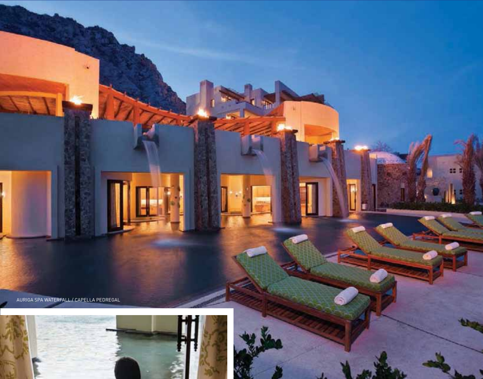
AURIGA SPA WATERFALL / CAPELLA PEDREGAL