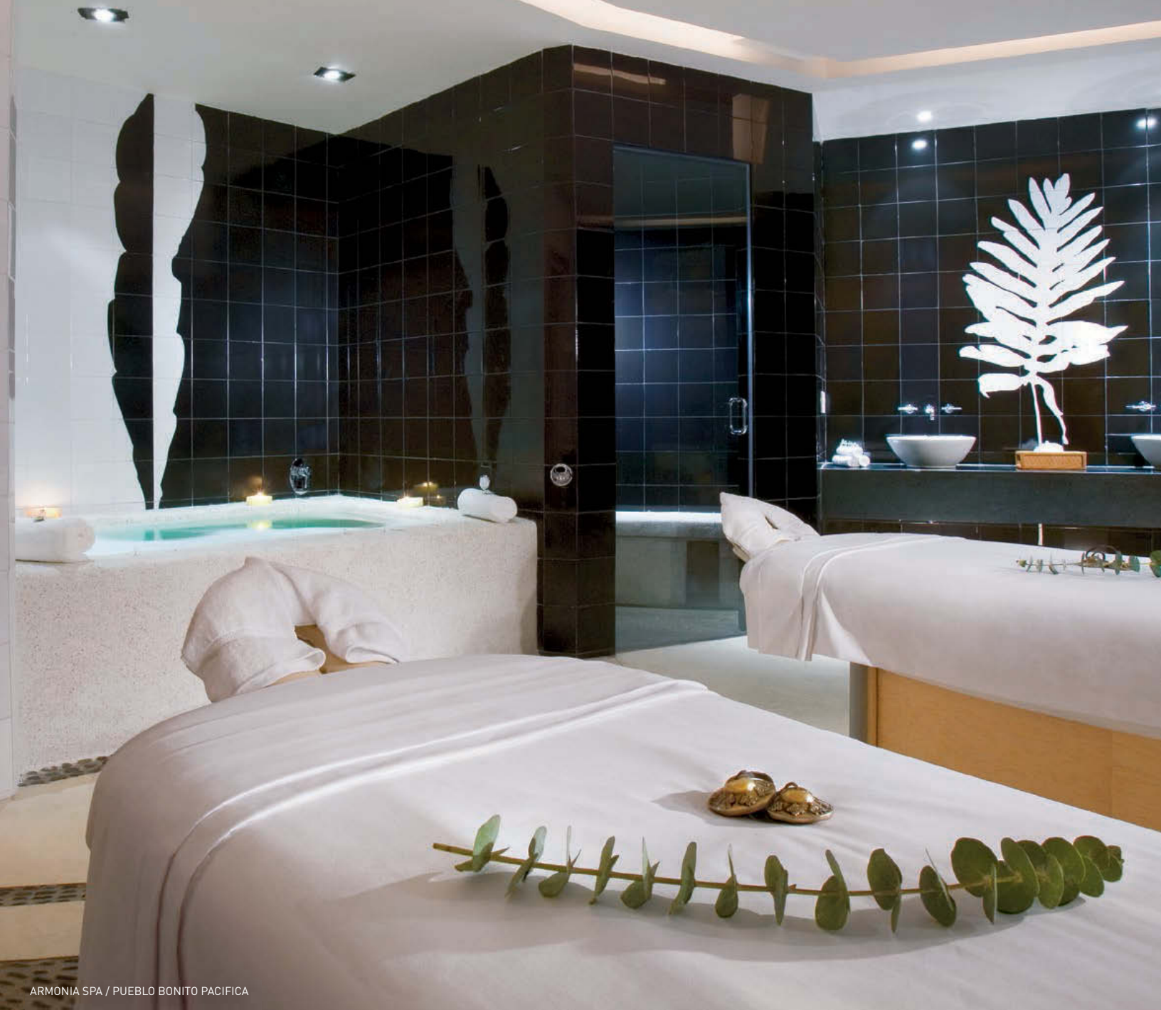
ARMONIA SPA / PUEBLO BONITO PACIFICA

A stay at Cabo San Lucas's Pueblo Bonito Pacifica isn't complete without stopping in at the award-winning Armonia Spa —just ask celebs like John Travolta, Kenny Chesney, Cindy Crawford and Kim Cattrall . Cattrall's Sex and the City co-star, Chris Noth , actually participated in Armonia's signature Temazcal ritual while staying in the property's ultra-luxe Oceanview Suite. Inspired by the traditions of ancient Aztec and Mayan civilizations, the Temazcal is a shaman-led ceremony designed to bring about spiritual, mental and emotional well-being ( www.pueblobonitopacifica.com ).