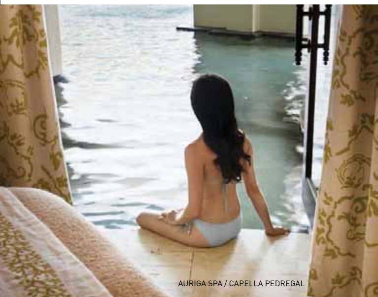
AURIGA SPA / CAPELLA PEDREGAL