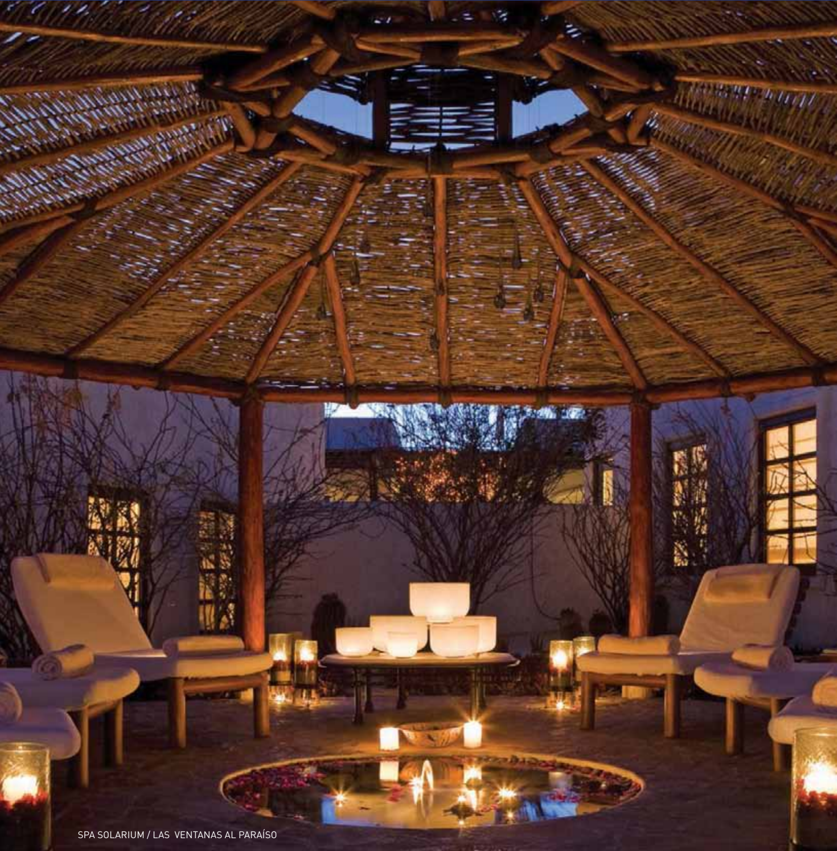
SPA SOLARIUM / LAS VENTANAS AL PARAÍSO