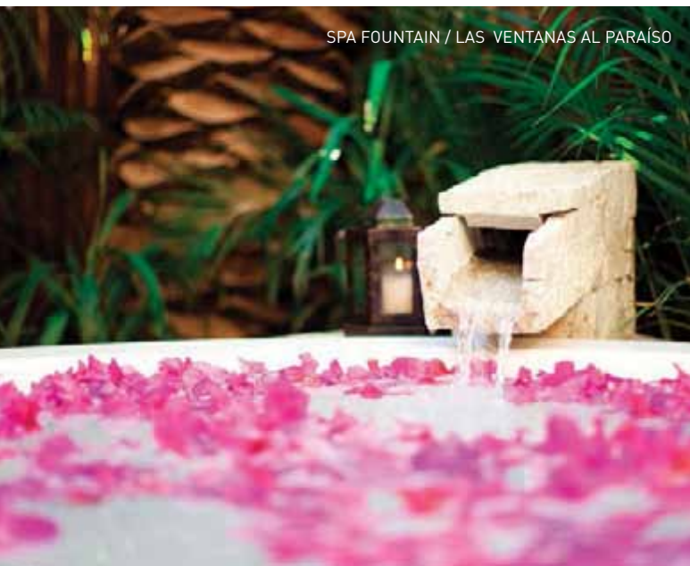
SPA FOUNTAIN / LAS VENTANAS AL PARAÍSO