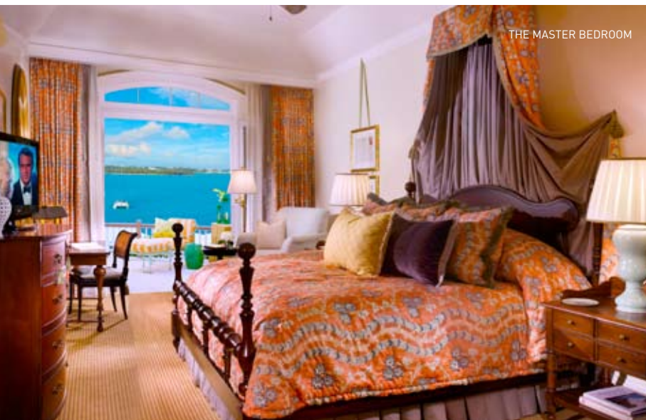
THE MASTER BEDROOM