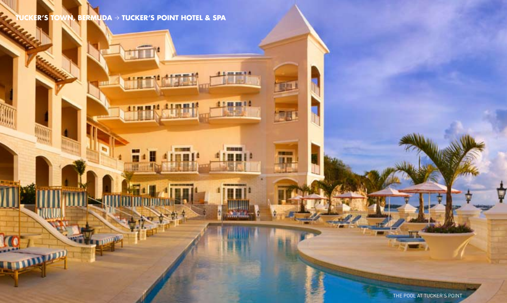
THE POOL AT TUCKER'S POINT