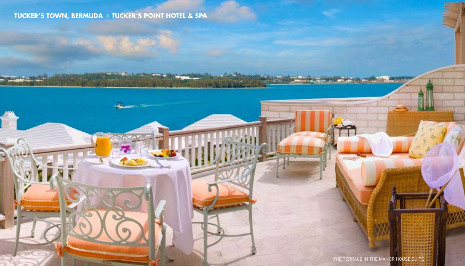
THE TERRACE IN THE MANOR HOUSE SUITE