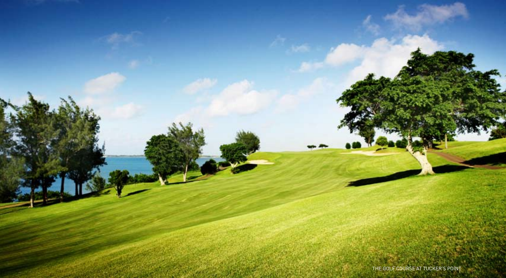
THE GOLF COURSE AT TUCKER'S POINT