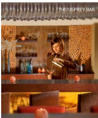
THE OSPREY BAR

Of course skiing is tops at Beaver Creek Mountain, where the sun shines an average of 275 days a year and a seemingly endless terrain of fresh powder is just moments away: The Osprey boasts the closest ski in/ski out hotel to a chair lift in all of North America, so guests can hit the slopes hassle-free. Whether