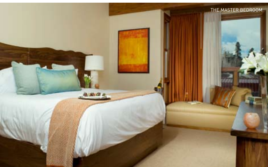
THE MASTER BEDROOM