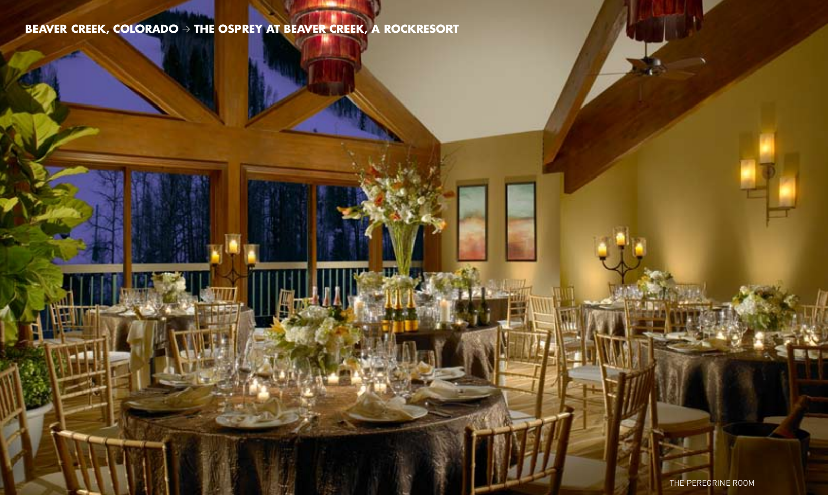
THE PEREGRINE ROOM