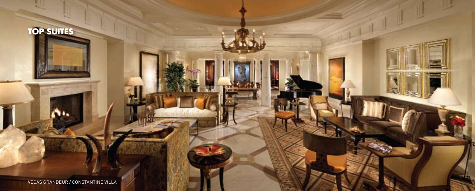
VEGAS GRANDEUR / CONSTANTINE VILLA