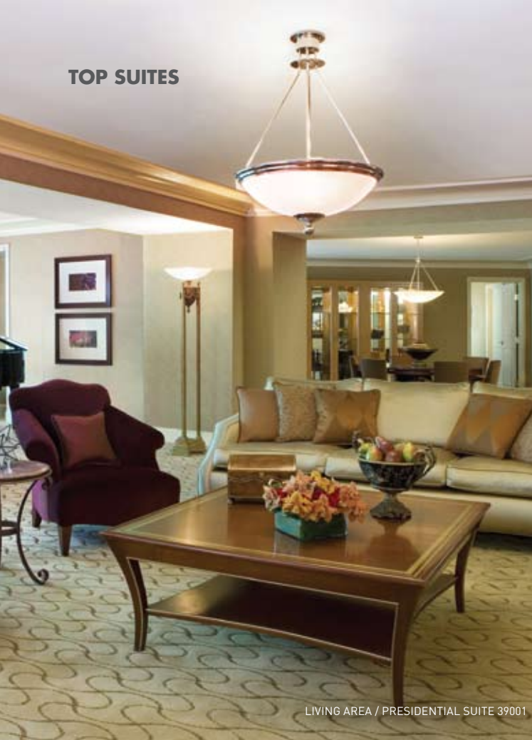
LIVING AREA / PRESIDENTIAL SUITE 39001