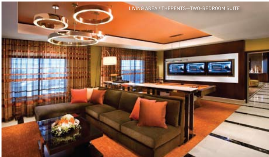
LIVING AREA / THEPENTS—TWO-BEDROOM SUITE