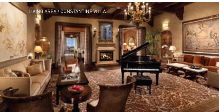
LIVING AREA / CONSTANTINE VILLA