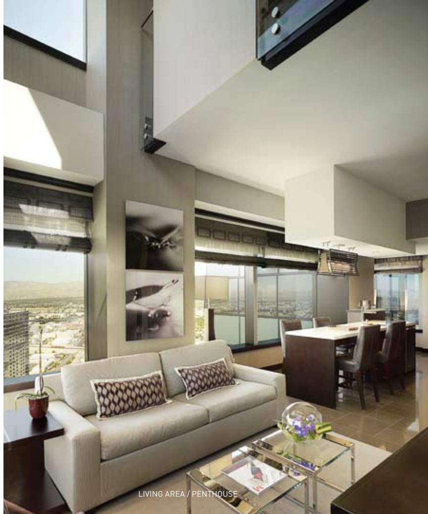
LIVING AREA / PENTHOUSE