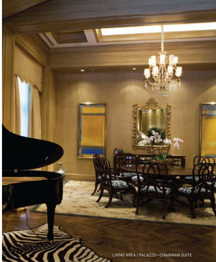
LIVING AREA / PALAZZO—CHAIRMAN SUITE