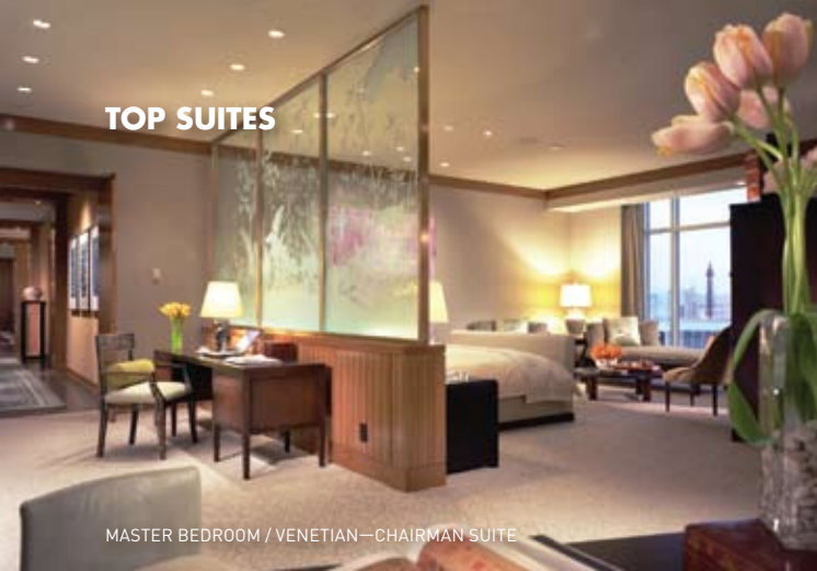
MASTER BEDROOM / VENETIAN—CHAIRMAN SUITE