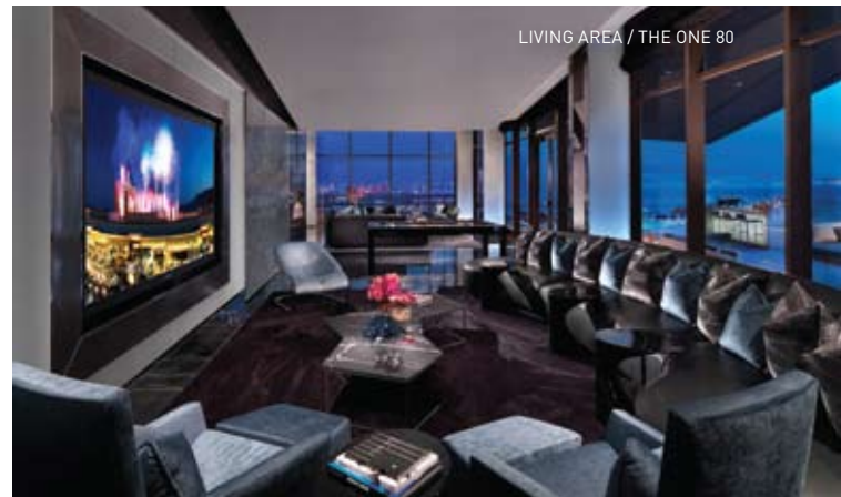
LIVING AREA / THE ONE 80