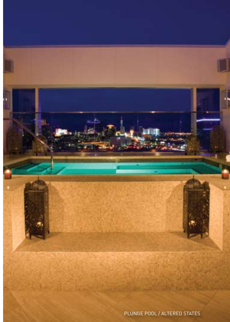
PLUNGE POOL / ALTERED STATES