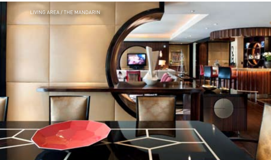
LIVING AREA / THE MANDARIN