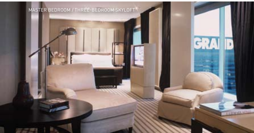
MASTER BEDROOM / THREE-BEDROOM SKYLOFT