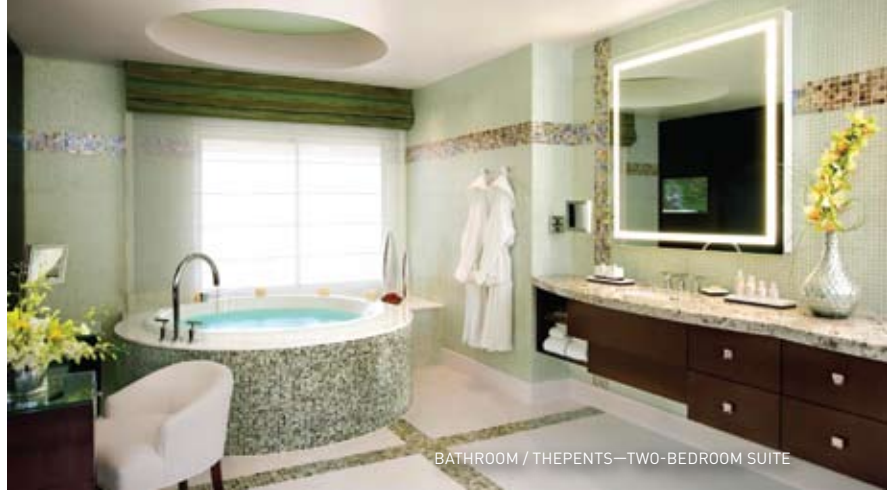
BATHROOM / THEPENTS—TWO-BEDROOM SUITE