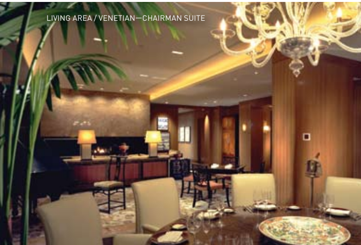
LIVING AREA / VENETIAN—CHAIRMAN SUITE