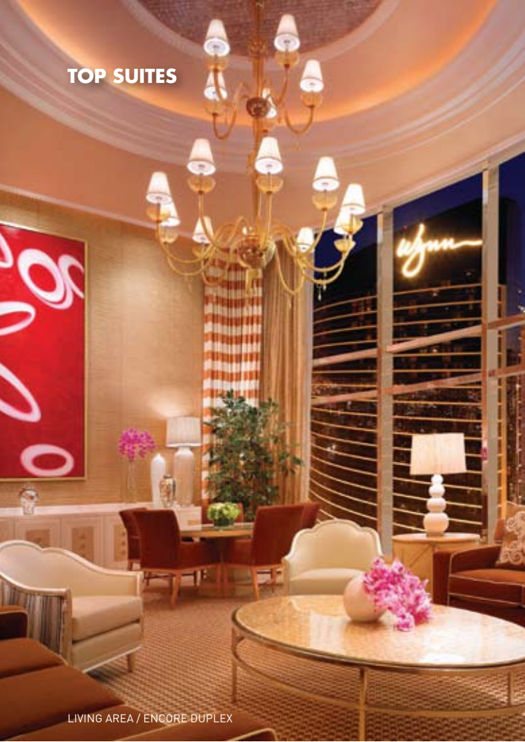
LIVING AREA / ENCORE DUPLEX