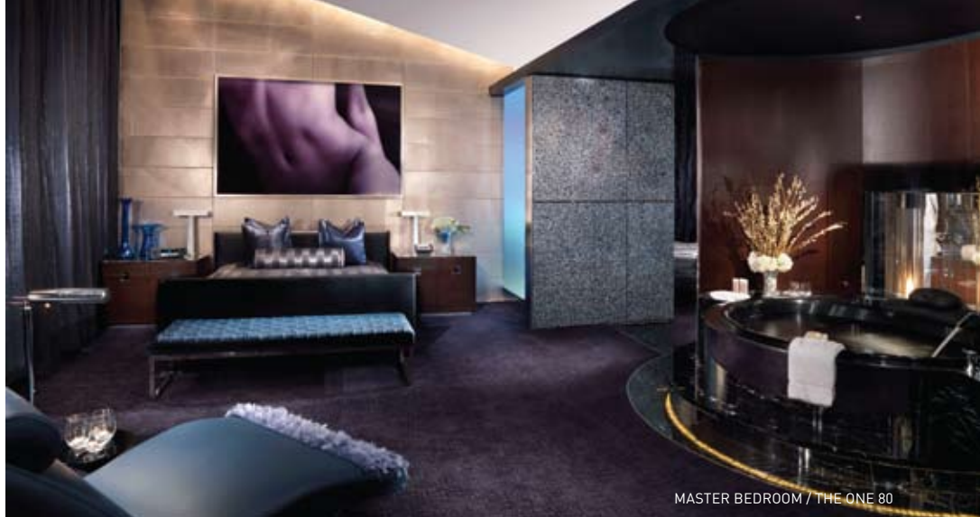
MASTER BEDROOM / THE ONE 80