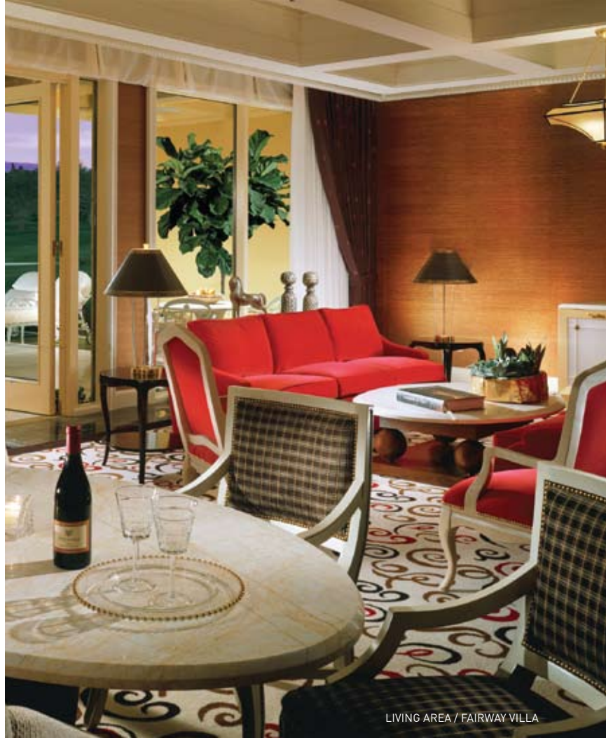
LIVING AREA / FAIRWAY VILLA