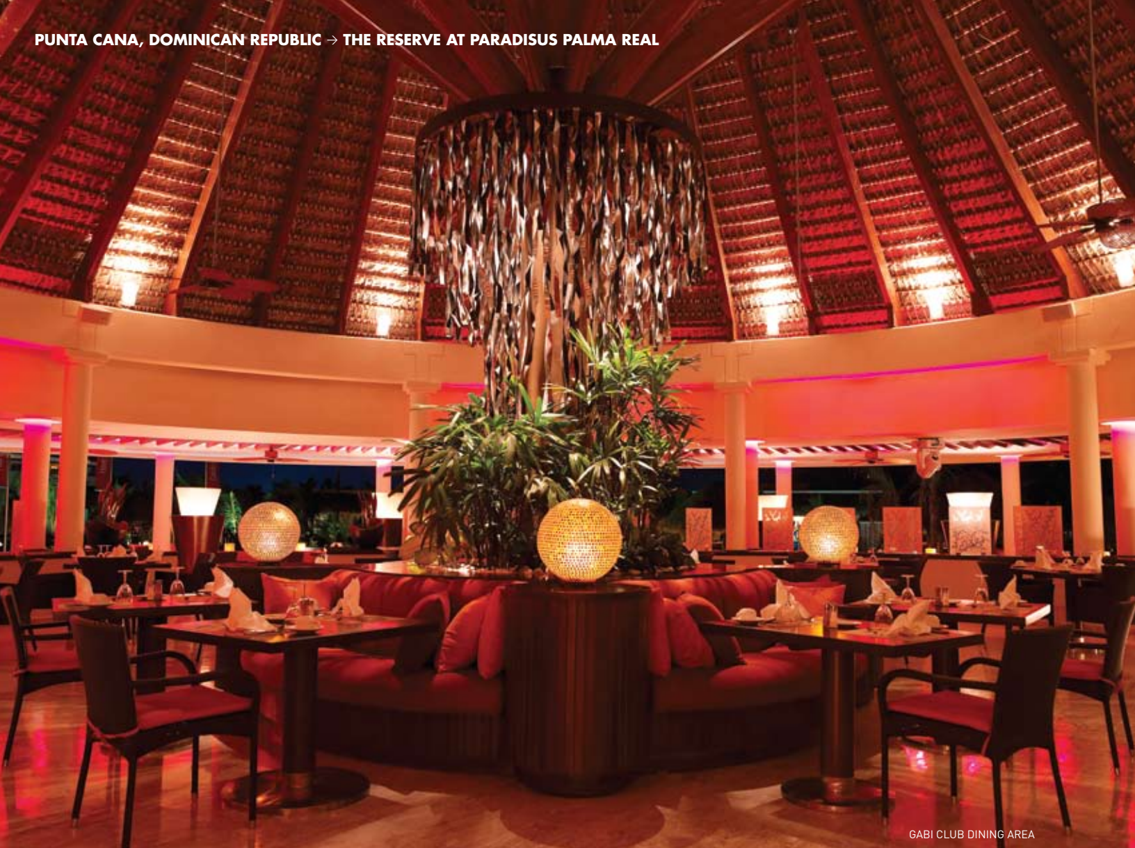
GABI CLUB DINING AREA