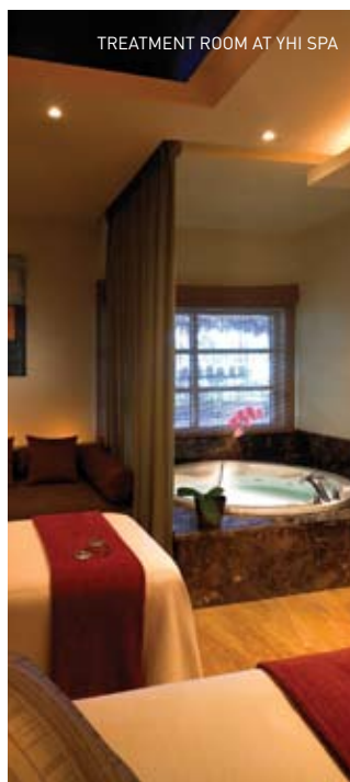
TREATMENT ROOM AT YHI SPA

Indulge your senses in the new YHI Spa, a 24,000-square-foot haven that offers pampering services of all kinds. The Zen-like sanctuary—with winding wooden walkways, soothing water fixtures and soft music playing in the background—features a treatment menu designed to balance, revitalize and energize your body. Treatments range from refreshing facials to detoxifying scrubs to restoring massages, all devised to promote a total sense of wellbeing inside and out. Try the Lotus, Gold & Rice Massage, a revitalizing massage that uses aromatherapy to restore energy in the body or the Green Exfoliation, a fully-organic treatment that deep cleans and moisturizes the skin. The full-service spa also has a boutique, a salon and a state-of-the-art health club with spin and yoga studio.