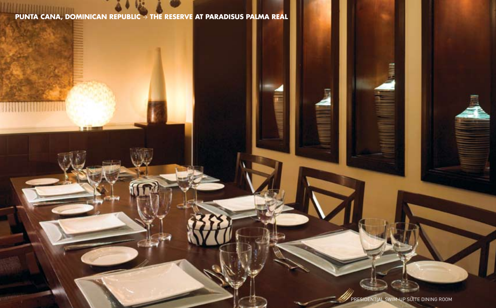
PRESIDENTIAL SWIM-UP SUITE DINING ROOM