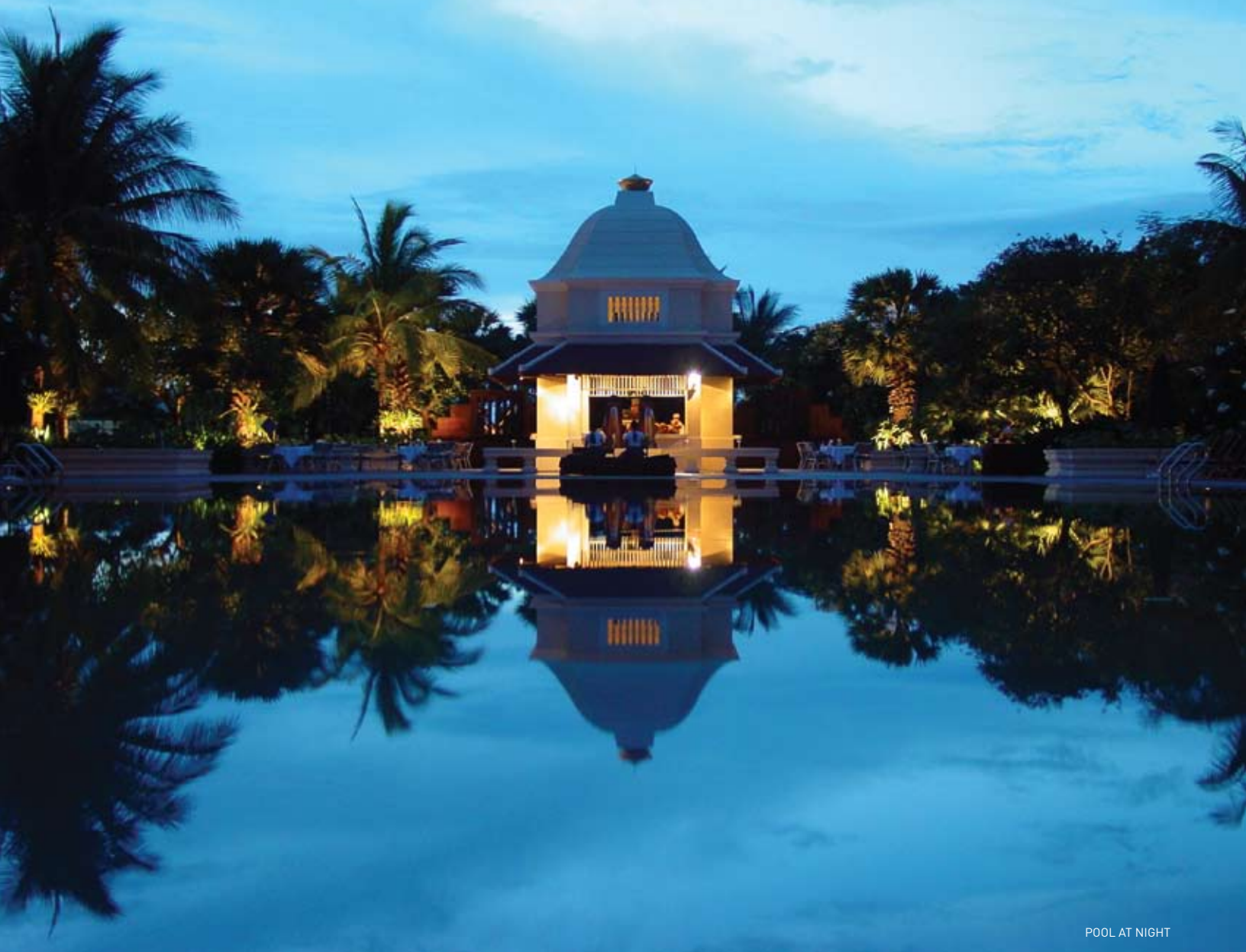
POOL AT NIGHT