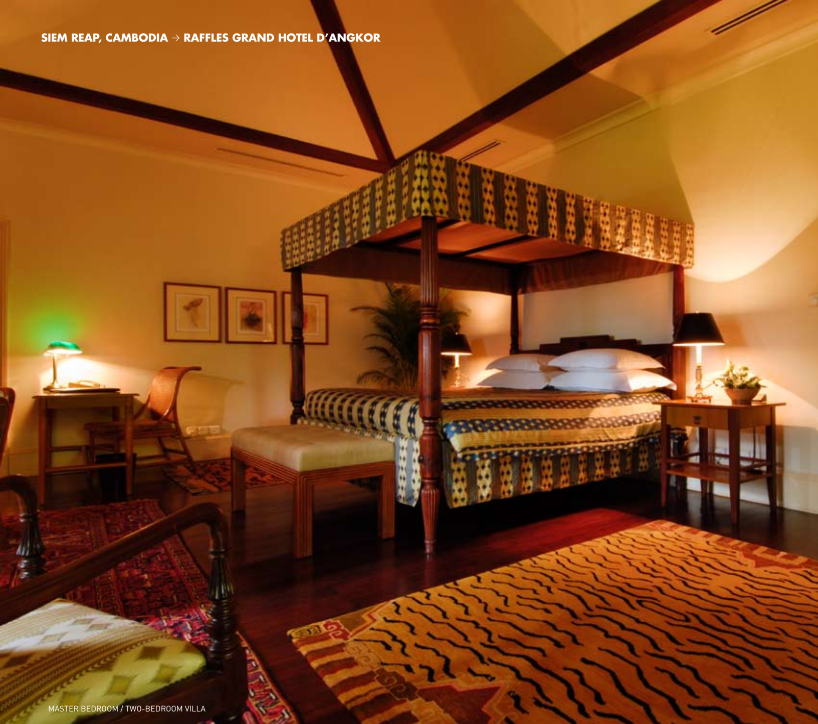
MASTER BEDROOM / TWO-BEDROOM VILLA