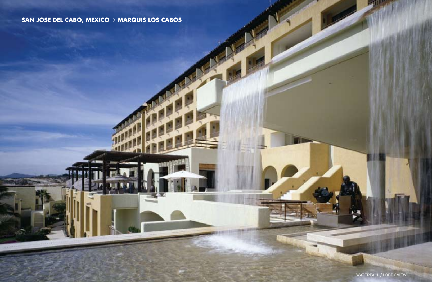
WATERFALL / LOBBY VIEW