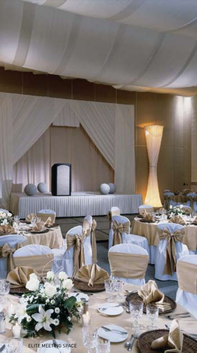
ELITE MEETING SPACE