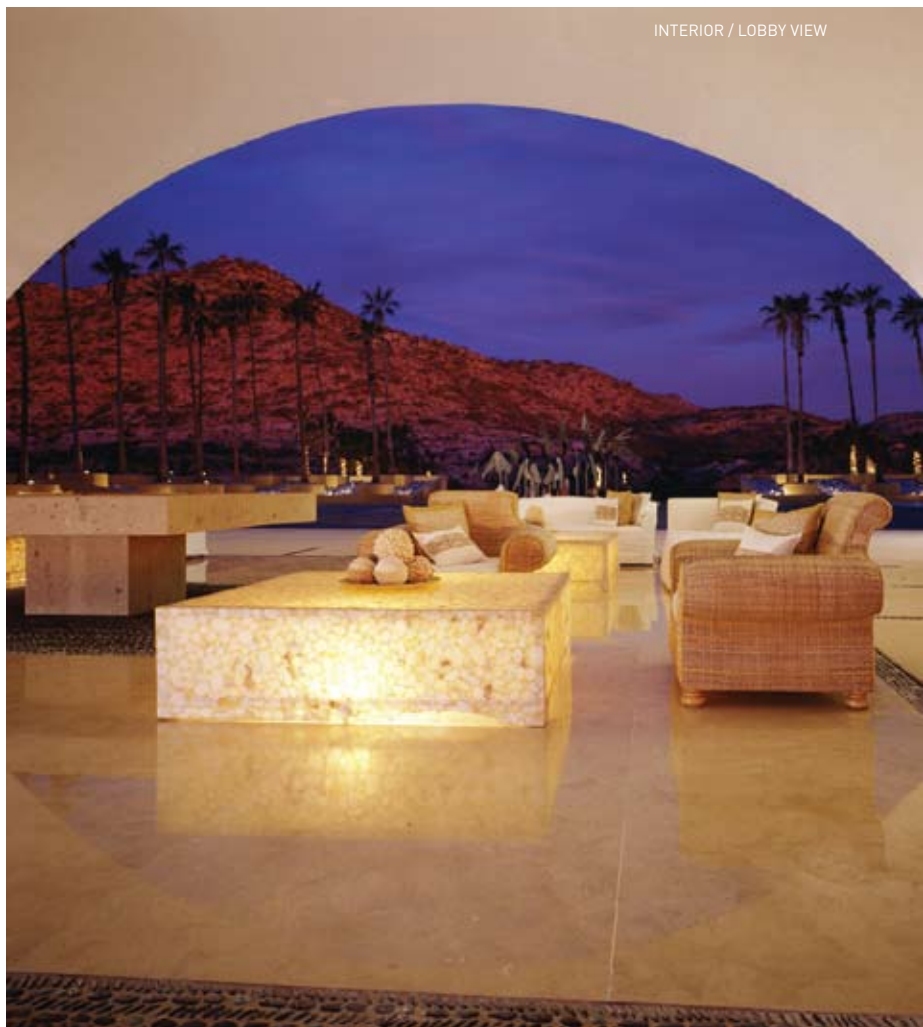
INTERIOR / LOBBY VIEW