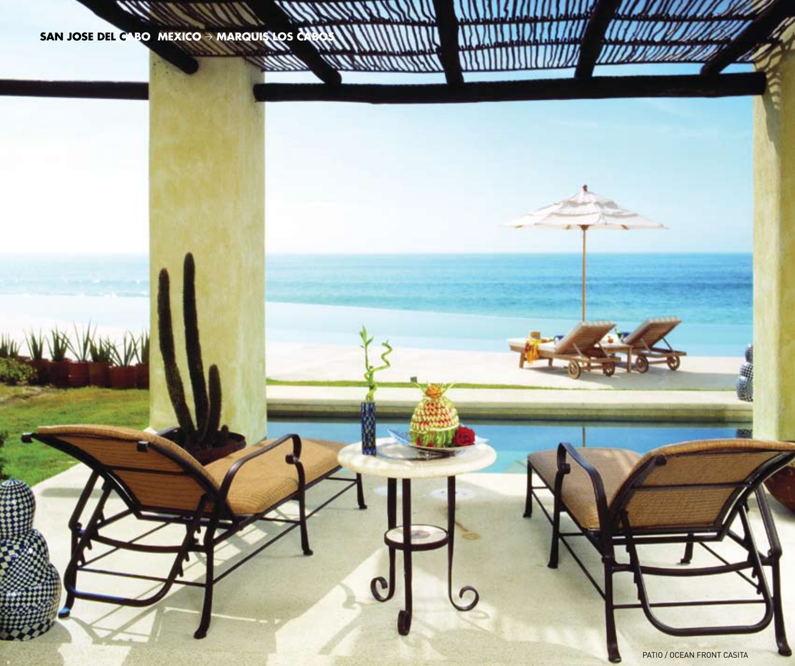
PATIO / OCEAN FRONT CASITA