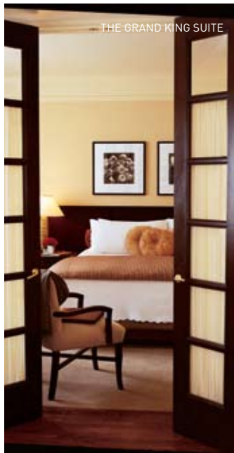
THE GRAND KING SUITE

All 353 guest rooms at Loews Regency boast spacious layouts with warm, comforting interiors designed to help visitors feel at home. Marrying modern and traditional elements to create a unique ambience, each room is accented with plush fabrics like velvet and silk, custom-designed furniture and hand-selected artwork. Deluxe amenities like Keurig coffee makers, iPod docking stations, granite-topped desks accompanied by ergonomically-correct leather chairs and complimentary daily delivery of the New York Times all make for thoughtful touches. During the summer months, early-morning joggers will receive towels and complimentary bottles of Evian, while services from the adjoining Nico Salon can be conducted in the comfort of your room all year round.