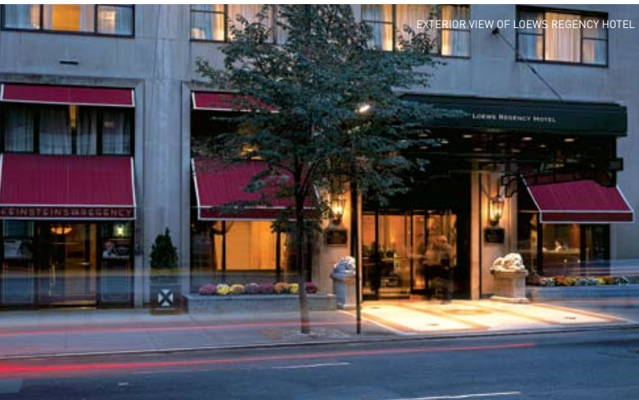
EXTERIOR VIEW OF LOEWS REGENCY HOTEL

Number of suites in hotel: 12 grand suites and 35 one-bedroom suites