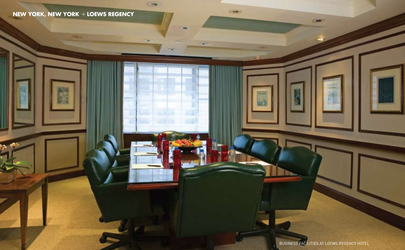
BUSINESS FACILITIES AT LOEWS REGENCY HOTEL