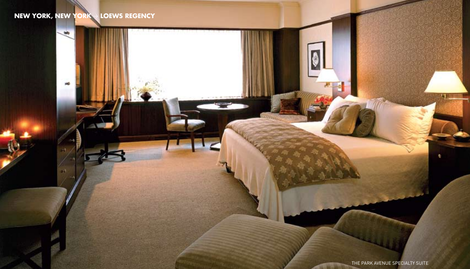
THE PARK AVENUE SPECIALTY SUITE