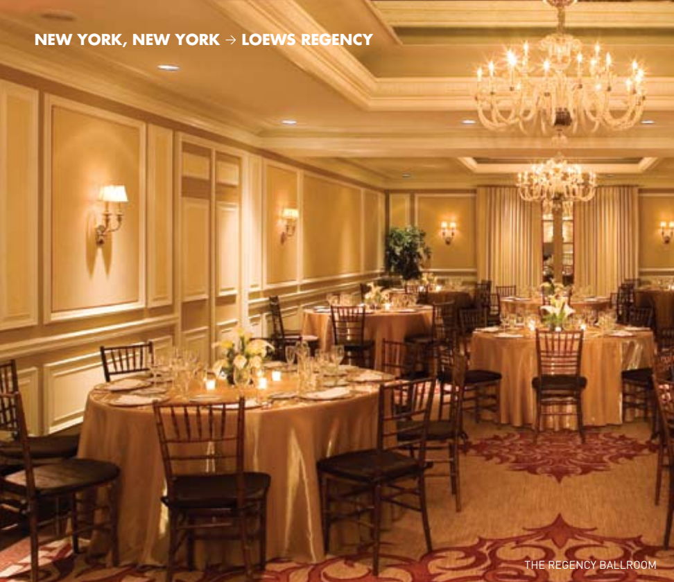
THE REGENCY BALLROOM