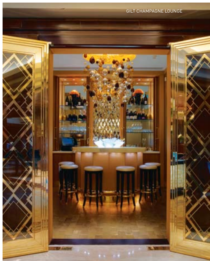
GILT CHAMPAGNE LOUNGE