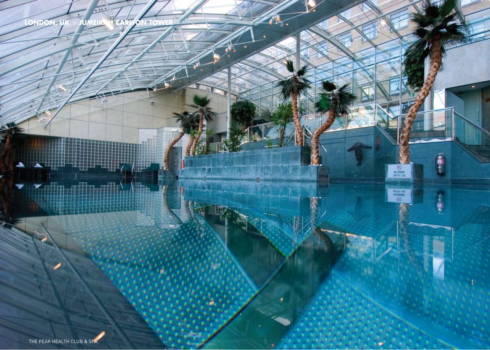
THE PEAK HEALTH CLUB & SPA