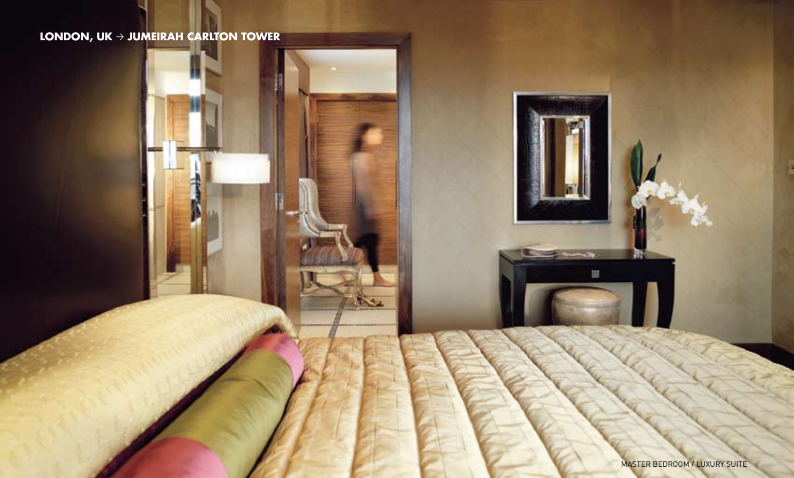
MASTER BEDROOM / LUXURY SUITE