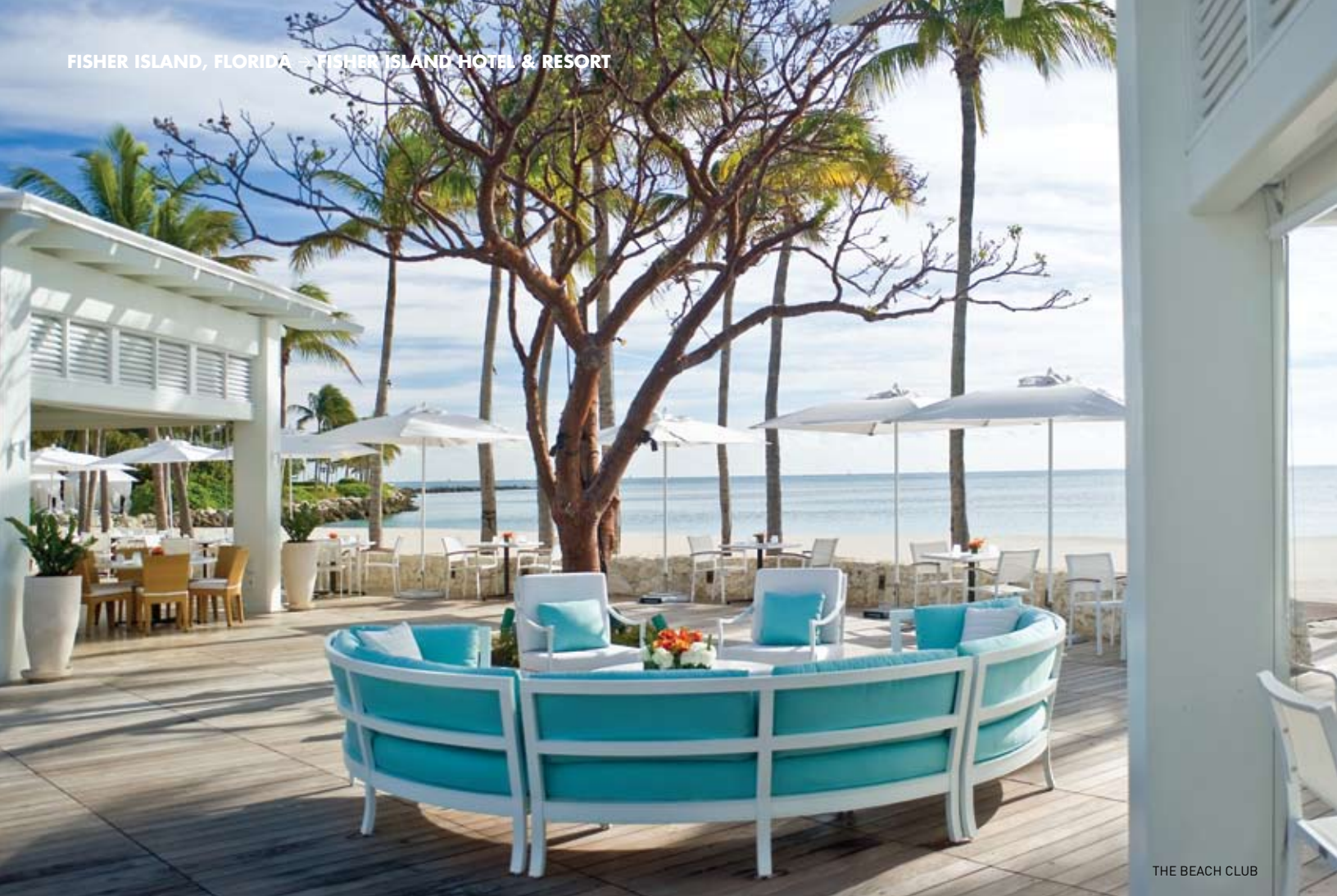
THE BEACH CLUB