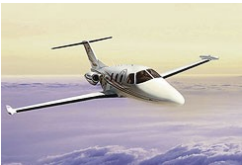
The Eclipse 500

Neither one is as responsive as the Eclipse. It's the nimblest of the three jets, rolling easily into steep turns, climbing impressively on just one engine on a warm New Mexico desert day. It has the feel of a sports car, both in the front seats flying the plane, and in the back seats riding as passengers. When I needed to move quickly out of the way of a glider near Moriarty, N.M., the plane jumped through the air.