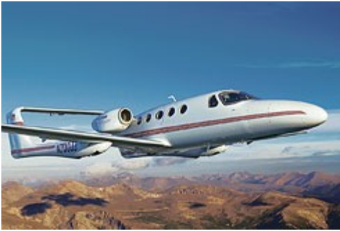
The Adam A700

The jet is made out of composite material -- super-strong carbon-fiber plastic, which is the same material Cirrus uses in its planes and Boeing will use in its new 787 wide-body jet. Composites can be stronger than aluminum and is easier to shape into aerodynamic curves, with no rivets to disrupt airflow. That makes it cleaner through the air, and faster.