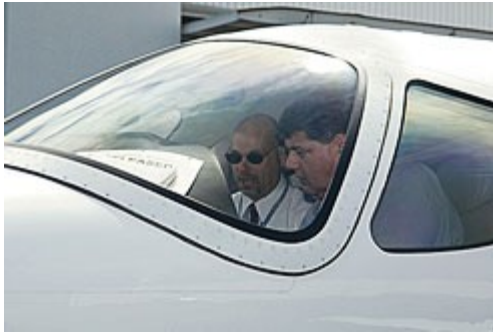
Cockpit of the Cessna Mustang

The Eclipse has the smallest cabin of the lot. With only 160 cubic feet of volume, the interior is 20% smaller than the inside of a Honda Odyssey minivan. The Eclipse has no separate luggage compartments -- pile your suitcases and golf clubs in the passenger cabin.